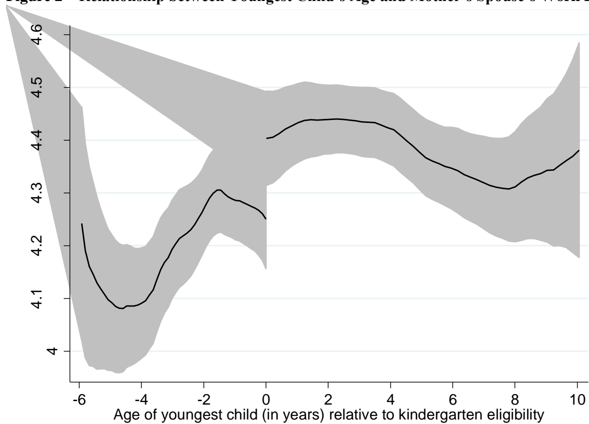
Figure 2 – Relationship between Youngest Child’s Age and Mother’s Spouse’s Work Hours

Notes: Local polynomial smoother is used. Gray regions represent 95% confidence intervals. Observations are weighted by mother’s sampling weights. Youngest child’s age is the relative age (in years) to kindergarten eligibility. Mothers’ spouses’ work hours are measured as the hours worked per week over all weeks in the past year.