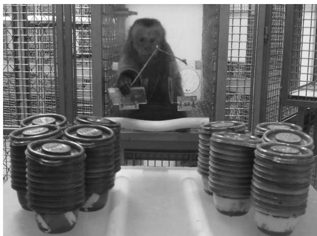
Fig. 1 Arrangement and presentation of decks. A capuchin monkey reaches for a deck of containers using specially designed doors. When the monkey opened one door, the other one closed. This prevented the monkeys from trying to select both decks simultaneously. Decks were presented to the subjects in five stacks of ten containers. Note that there were ten more containers in each deck than was necessary to complete 40 trials. This was so it never appeared to the subjects that they were nearing the end of the task or running out of containers, even if they preferentially selected from one deck. The presentation of the decks was identical across species, including humans. The monkeys were trained to voluntarily enter their test enclosures. After testing, they were returned to their social group