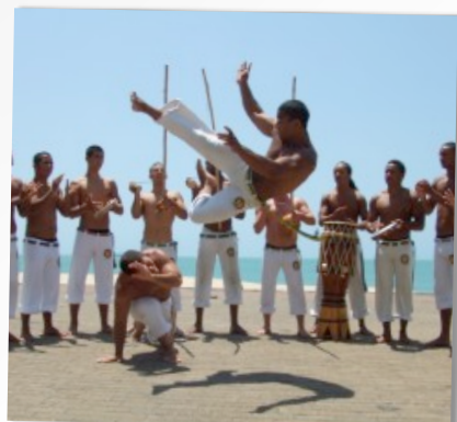
CAPOEIRA AFRO-BRAZILIAN MARTIAL ART