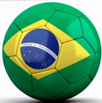
BRAZIL HOSTS 2014 WORLD CUP

abilities while using music, film, and other media resources to learn more about Brazil and the Lusophone world.