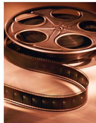
The Film-in-Ethics series offers a cultural context for the discussion of ethics